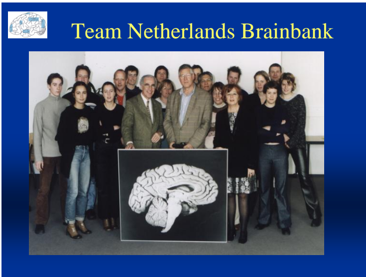
The team of the Netherlands Brain Bank 2006